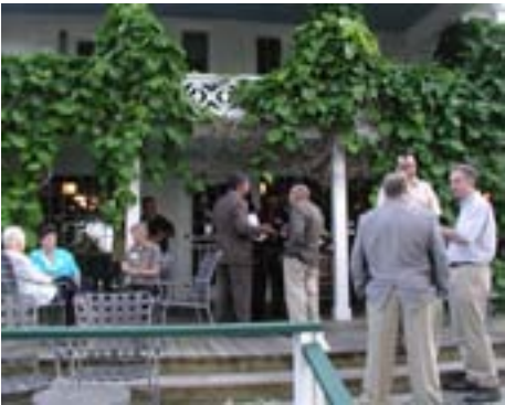
Cocktail hour spills out onto the porch and terrace.