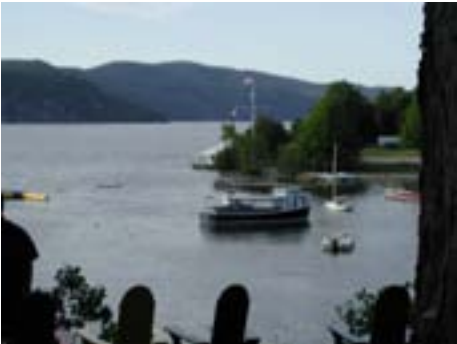
Lovely Basin Harbor.